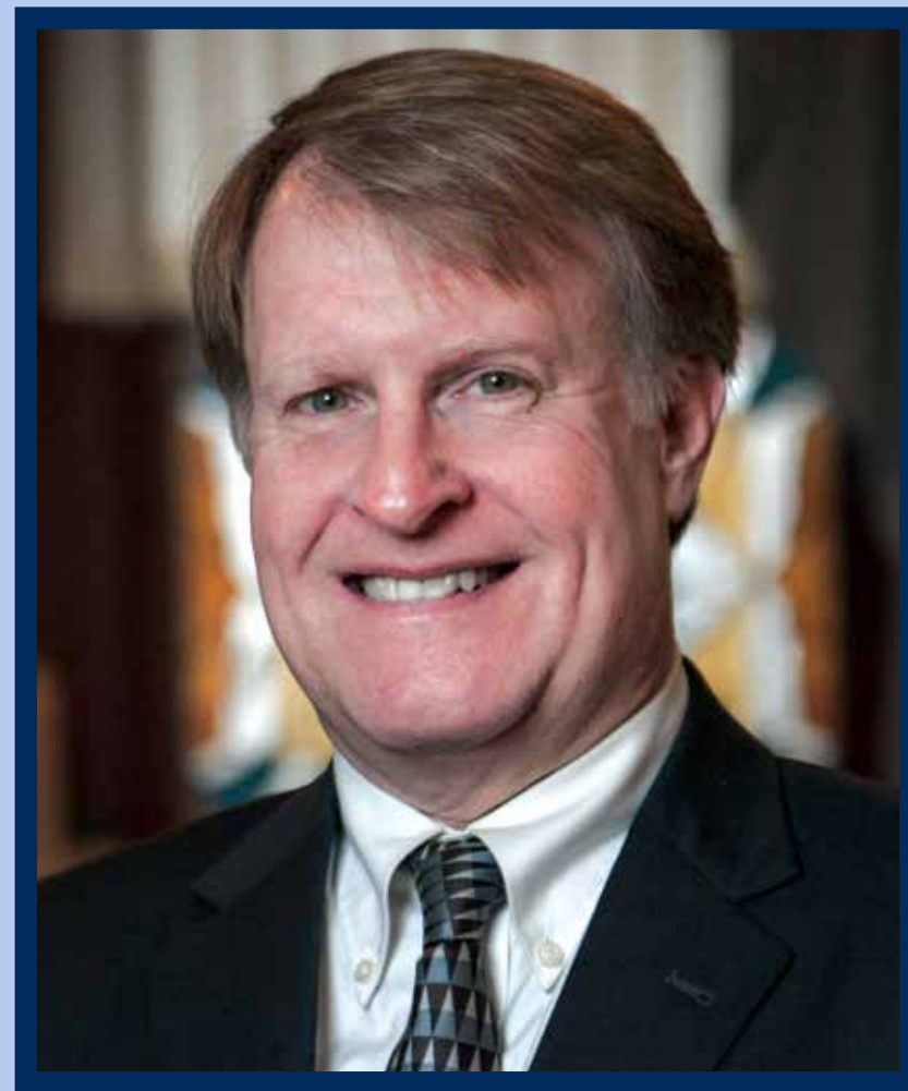
Rich Fitzgerald Allegheny County Executive

The Institute of Politics (IOP) at the University of Pittsburgh dedicated much of its 2015 annual retreat for elected officials on the topic of mass incarceration. Allegheny County Executive Rich Fitzgerald asked IOP to assemble a group of distinguished civic leaders to examine what could be done to make incarceration policies and practices in Allegheny County “fairer and less costly, without compromising public safety.”